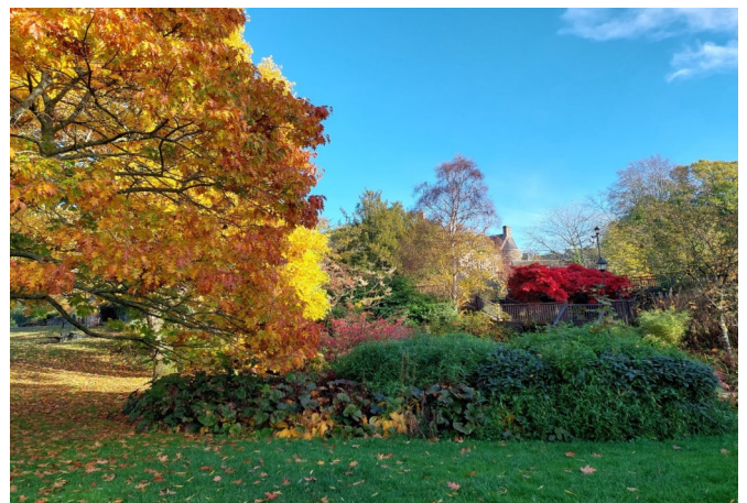
Autumn colours - Norie-Miller Walk in Riverside Park