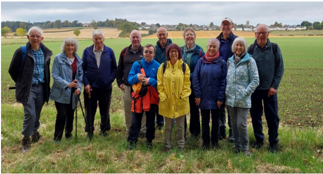
Our October walk on a beautiful autumn day near Errol